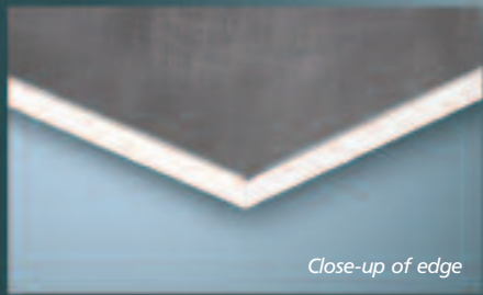
Close-up of edge

See back for detailed rendering of product installation