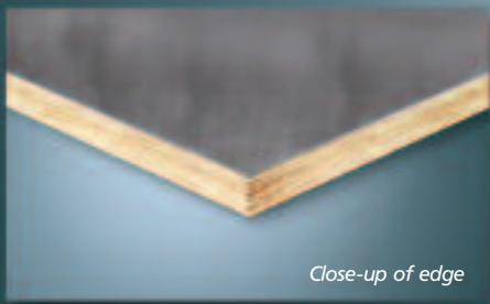
Close-up of edge

See back for detailed rendering of product installation